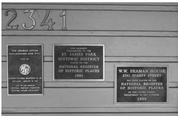
The set of plaques that inspired Theer: the W.W. Seaman House at 2341 Scarff Street is a Los Angeles Historic Cultural Monument, a Contributor to the St. James Park National Register Historic District, and is individually also listed on the National Register.

We had to submit "a 7.5 or 15 minute series United States Geological Survey (USGS) map." It took hours to figure out what this was. More hours to figure out which one showed our house. "No copies," the Feds warned, anticipating a rivalry with Chinese "7.5 or 15 minute series" map bootleggers.