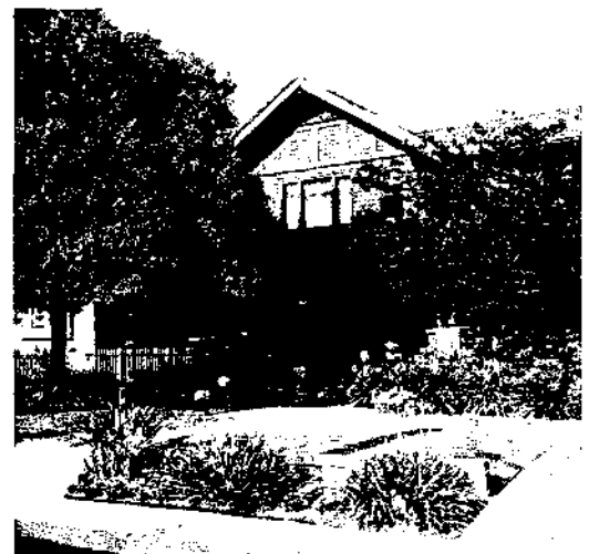
Corinne and Dave Pleger were finalists in both the paint and garden contest categories