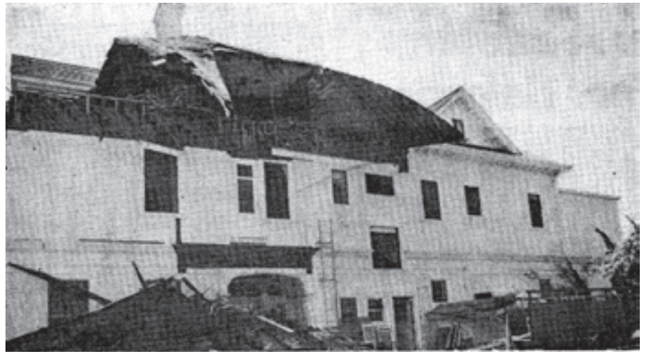
Demolition of Childs Mansion continues as more valuable parts of venerable structure are removed.

Historic preservation efforts throughout late 20th century America have been galvanized by flash-point actions such as the 1963 demolition of the legendary beaux arts Penn Station in New York City. That demolition caught the preservation community napping. The universal outrage in that case led to the establishment of the New York City Landmarks Commission.