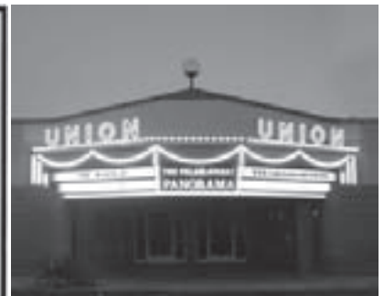
Silent Screen vamp Louise Glaum (left) once owned the Union Square Theatre.